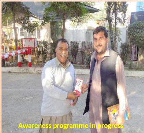
Awareness programme in progress

measures against the deadly viral HIV/AIDS.