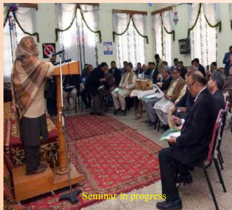
Seminar in progress

A number of participants during interview informed the Frontier News correspondent that they realized and analyzed their actual situation and came up with plans to uplift the services and to sustain their projects/institutions, as aim of the seminar was to become 'Self Reliant' in the real sense of the word