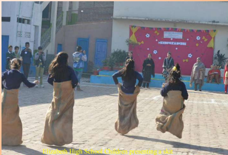
Elizabeth High School Children presenting a skit