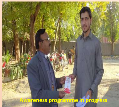
Awareness programme in progress

It is pertinent to mention that a 2-years HIV/AIDS awareness programme sponsored by the Church of Scotland is going on being implemented by the Development & Relief Sector of the Diocese of Peshawar. This awareness project is meant for marginalized community living in the suburbs and slum areas of the Khyber Pakhtun Khwa Province. Thus, this International Day campaign and inclusion of the Muslim majority was an additional activity.