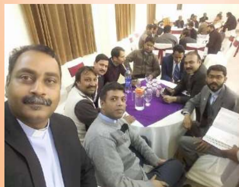
Group work in images