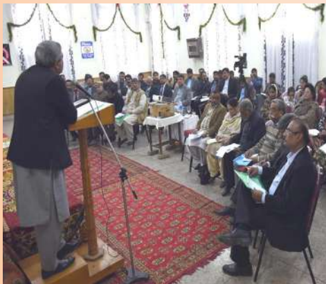
Seminar in progress