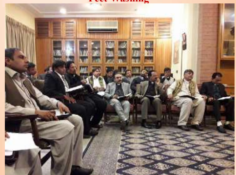
Session in progress