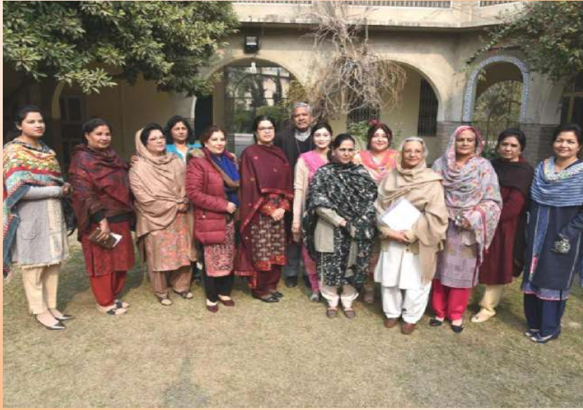
Group photo of the seminar female participants and speaker