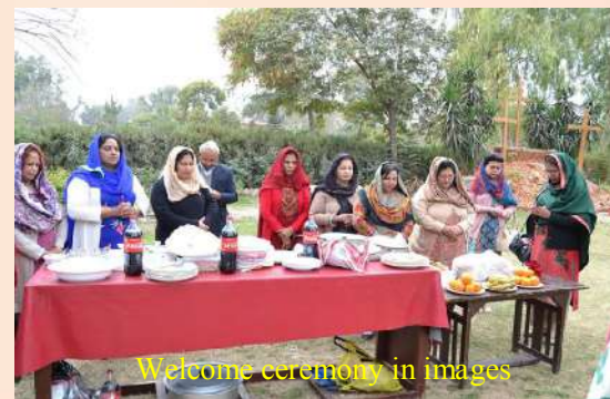
Welcome ceremony in images

The "Rafaqat-e-Khawateen" is renowned for its activities for the uplift of Women and are always helpful to the Church.