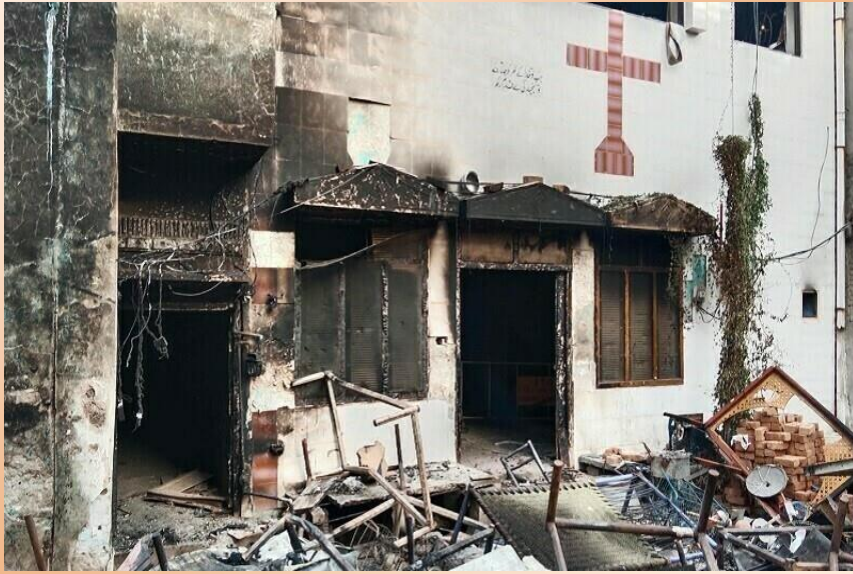
A Church in Jaranwala, desecrated and destroyed