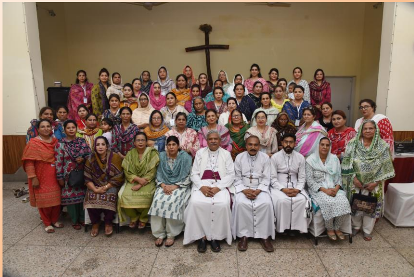
Group photo of the Women Council participants with honorable Bishop