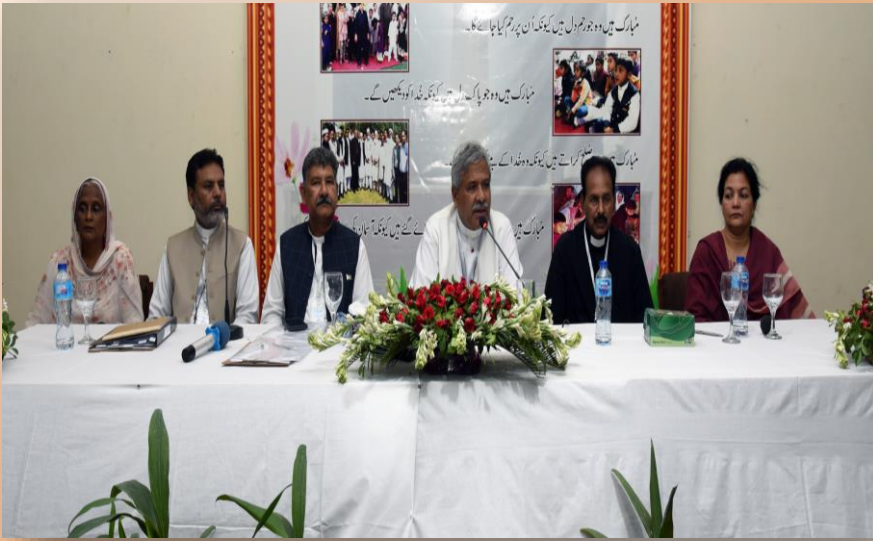
Diocesan New Office bearers with honorable Bishop