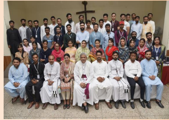
Group photo of Youth Council participants