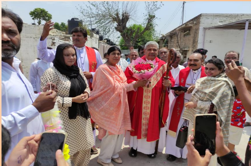
Bishop being presented a bouquet on his welcome