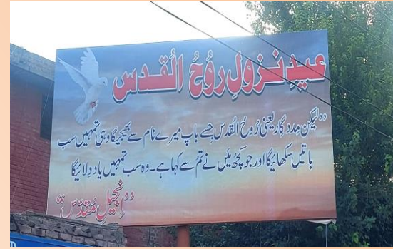
Bill board on the main road about the Holy Spirit

A billboard in Urdu is erected on the main boulevard, in front of the St. John's Cathedral Church, Peshawar. The Christian community when looking at it feels proud, whereas, the Muslim majority also admires verses from the Injeel (The New Testament). Such initiatives and approaches further strengthen the presence of the local Pakistani Church in the area. This also is a humble approach, "Thy Kingdom Come."